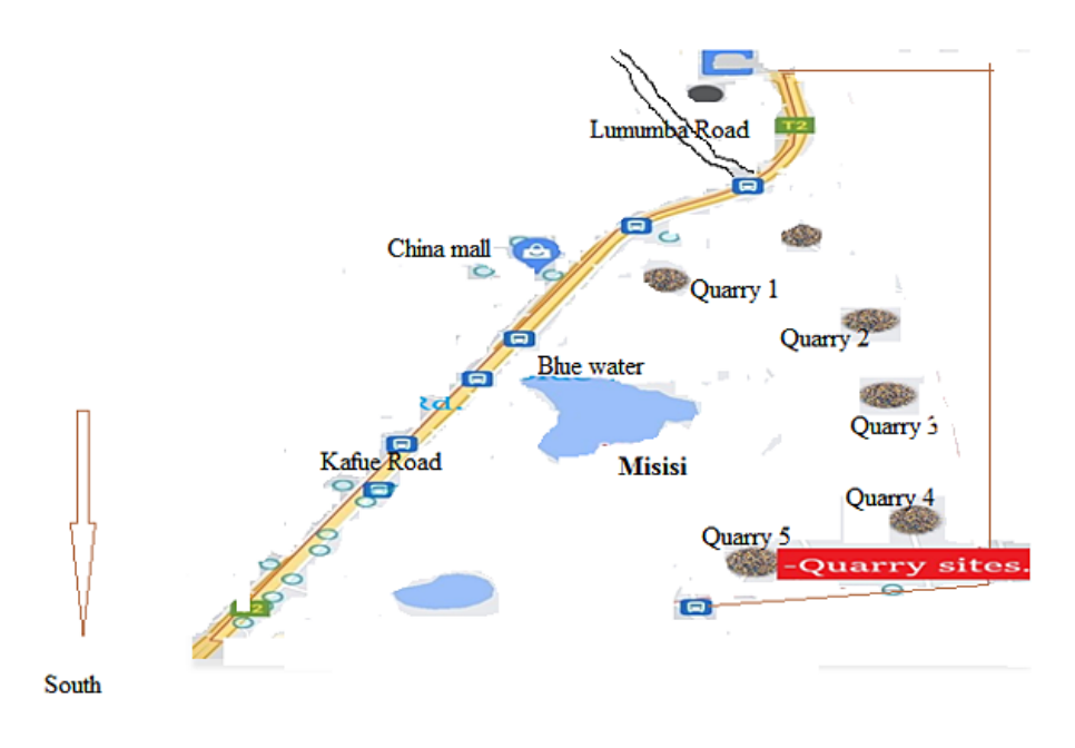
Fig. 1: Location of the study area (Misisi compound, Lusaka)

In most cases, workers are unaware of the extent and degree of dust exposure at quarries until they develop fatal respirable related diseases. However, putting in place adequate control measures can lead to a reduction of exposure levels.<sup>13,9</sup> Respirable dust particles, because of their small size, may reach the alveoli when inhaled.