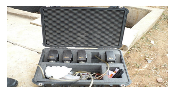
Fig. 3: Dust sampling kit

mild soapy water. The cyclone was then wiped with a clean dust-free tissue. Figure 3 shows the gravimetric pump and assembly used in the study.