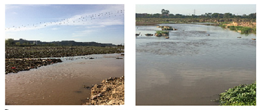
S1 : SIRSA RIVER U/S BADDI REGION BEFORE CONFLUENCE WITH EFFLUENT NALLAH