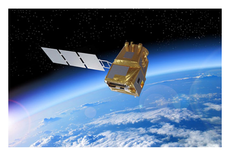
Fig. 2: LST Monitoring (LSTM) satellite.<sup>38</sup>

In addition to their use in weather forecasting, LSTs have various practical applications such as estimating evapotranspiration, detecting frost, monitoring crop water stress, and studying thermal inertia. This highlights the practicalities of using satellite data to understand and manage environmental phenomena related to LST fluctuations.<sup>37</sup> The use of satellite derived LST observation for LST calculation is depicted in Figure 2.