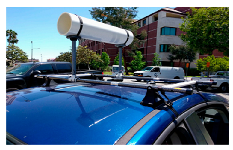
Fig. 5: A mobile-observations apparatus

eradication is not always possible. The paragraph emphasizes the importance of users critically evaluating data restrictions imposed by the observation platform, as well as the construction of a radiation barrier to address issues provided by specific conditions such as direct sunlight. However, employing the shield outside of its intended context should be avoided because it may result in measurement mistakes despite the look of authentic data.<sup>54</sup>