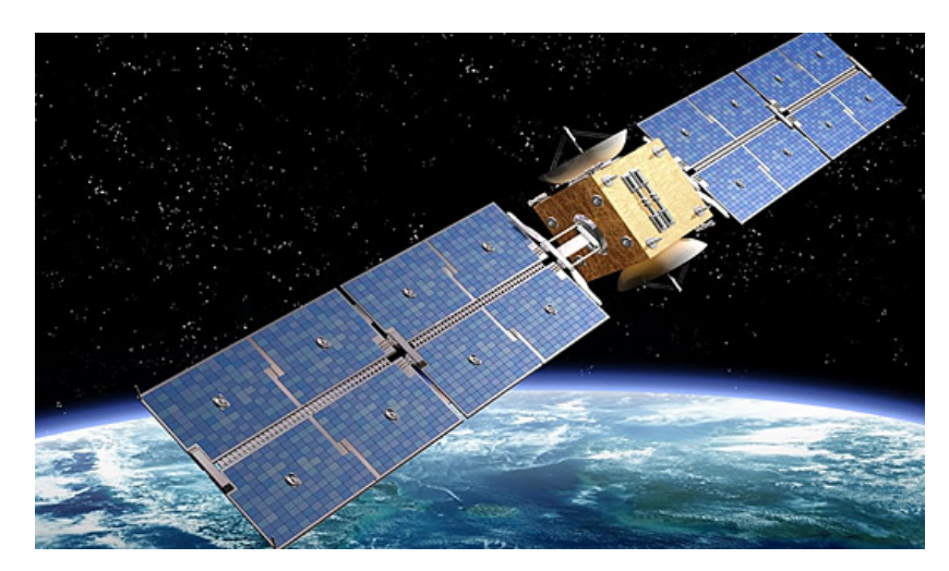
Fig. 3: A remote sensing satellite.42

fourteen NASA satellites in geosynchronous and sun-synchronous orbits, each equipped with a variety of sensors, improves the capacity to discover large-scale patterns and insights.<sup>41</sup> A satellite built for remote sensing, with a focus on radiation detection and monitoring, is shown in Figure 3.