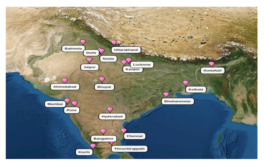
Fig. 6: Urban heat island research in Indian metropolises.