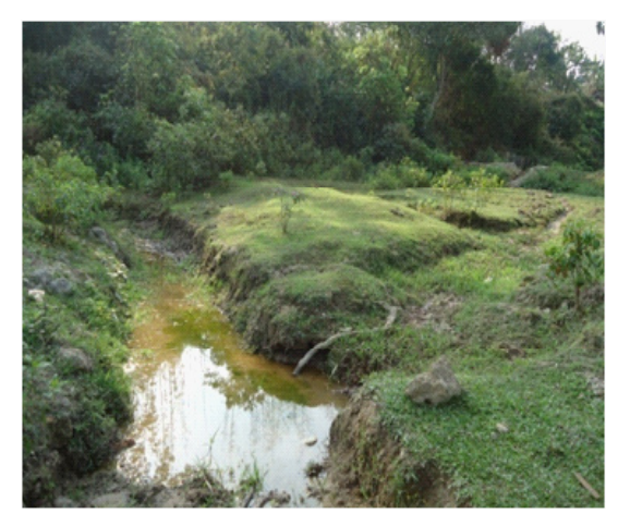
Fig. 1a: Temporary Pool