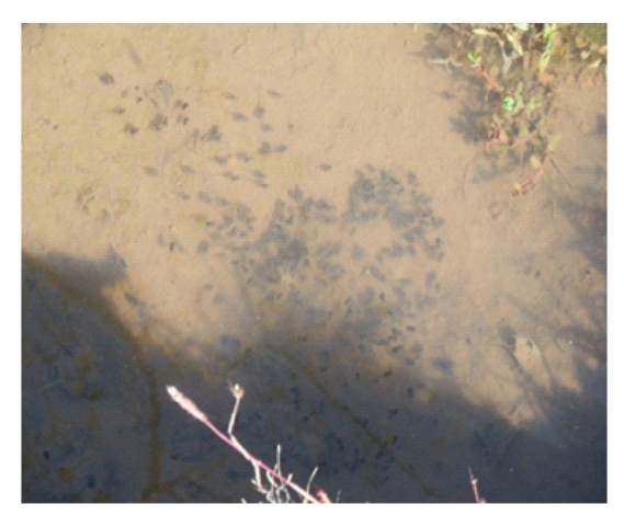
Fig. 1b: Tadpoles of Microhyla ornata