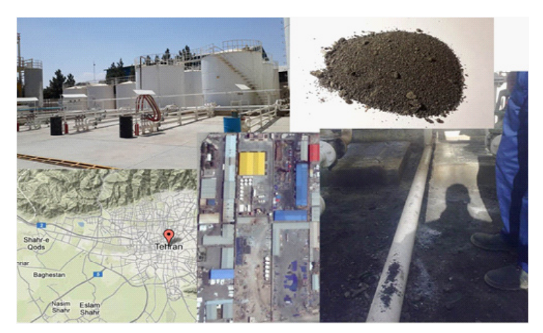
Fig. 1: PAHs contaminated soil sample collected from Rey Petrochemical Industry

Its effects are related to the strength, ductility, air void content, freeze-thaw durability, permeability, shrinkage, creep rate, specific heat, abrasion resistance, coefficient of thermal expansion