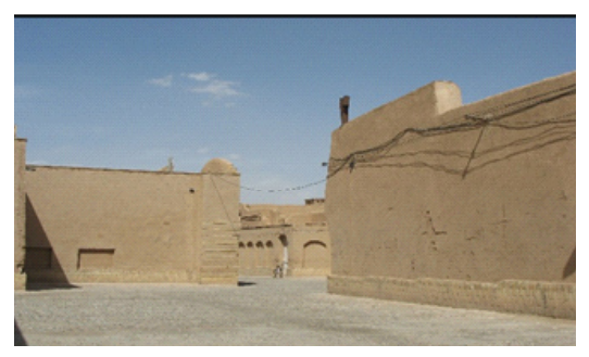
Fig. 5: Impasse in historical neighborhood, Yazd, Iran

It should be passed from time borders to study and recognize third places. For example Arab coffee shops, German bierstube, Italian Faberna, stores of American ancient suburbs are examples of third places.