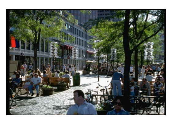
Fig. 1: active urban space, France

Distinctive and fixed users are one of third place properties. Livability and happiness are marks