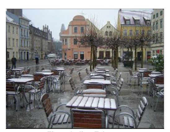
Fig. 3: Italian Faberna

Altman construes local coffee shops as secondary territory and refers that local coffee shops have diverse customers or users such as: fixed customers, time to time customers and different groups who go to coffee shop in different hours of day. Fixed customers have distinct place in most cases, and use coffee shop for different works such as financial works, receiving and reading the letters,