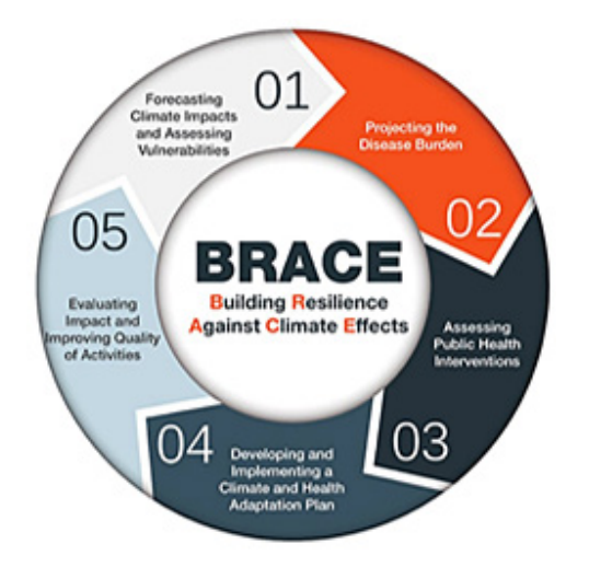
Fig.2: Framework of the Centers for Disease Control and Prevention (CDC), Building Resilience against Climate Effects (BRACE), Adopted and modified from Centers for Disease Control and Prevention.<sup>39</sup>

outdoor workers, multiple approaches would be required. Employers' and employees' readiness in mitigating the impacts of climate change can not only be evaluated by recognition and anticipation of potential occupational safety and health hazards and climate change, but also their mitigation methods.<sup>49</sup> For example, adaptation and mitigation policies of climate change couldresult in changes in building design and energy consumption which can have positive impacts on health and safety of workers. The scope of occupational health surveillance should be expanded to incorporate health and safety impacts caused by climate change on workers.<sup>49</sup>