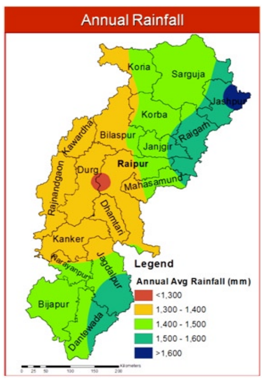
Fig. 1: Annual rainfall variability in Chhattisgarh state

The entire state has been divided in to five major categories (Fig. 1) namely very high rainfall zone (rainfall >1600 mm), high rainfall zone (1500-1600 mm), medium rainfall zone (1400-1500), low rainfall zone (1300-1400) and very low rainfall zone (<1300mm). The spatial distribution of rainfall shows that south Easter Bastar region comprising of some part of Jagdalpur and Dantewara, eastern part of northern hills zones comprising of most part of Jashpur and some part of Sarguja and north eastern parts of Chhattisgarh plains zone comprising of most part of Raigarh and some part of Janjgir, Raipur and Mahasamund receive high to very high rainfall. The reason being that in these part of state the onset of monsoon is bit early than other parts of the state, thus monsoon remains active for longer period in these part. Other regions contributing of high rainfall can be the thick forest cover and orographic sector of rainfall due to undulating area. The whole districts of Bijapur and parts of Dantewara, Narayanpur, Jagdalpur, Koriya, Sarguja, Korba, Bilaspur, Janjgir, Raipur, Mahasamund, and Raigarh receive medium